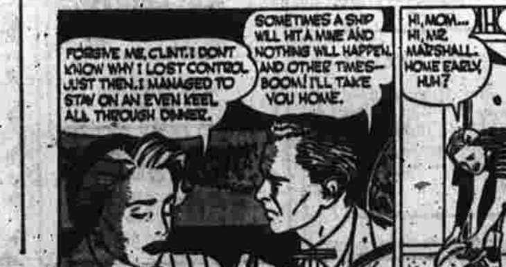
FRECKLES AND HIS FRIENDS