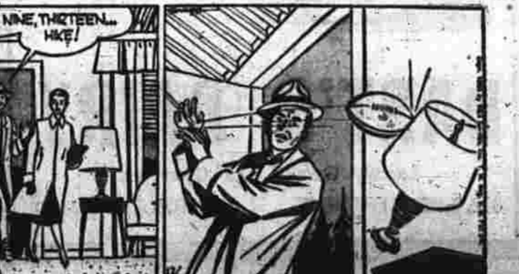
Home Again? BY MERRILL C. BLOSSER